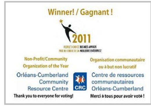
Congratulations to all our employees and volunteers for their excellent work.

Last fall, our Centre was awarded the 2011 Non-Profit Community Organization of the Year award by the Orléans Chamber of Commerce.