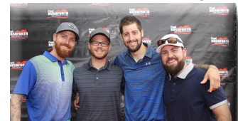
Team Brival Landscaping