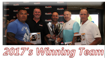
2017's Winning Team